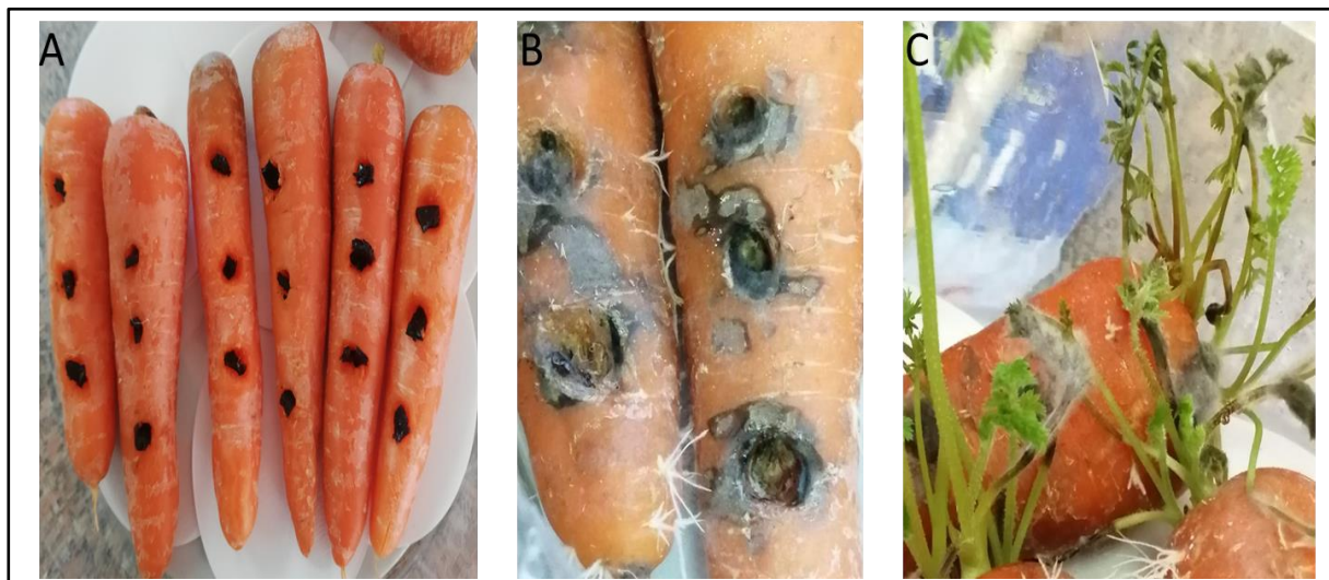
Fig. (4): Pathogenicity tests of Alternaria alternata on carrot roots under laboratory conditions. A: zero-time post inoculation, B: 10 days post inoculation and C: symptoms on leaves.