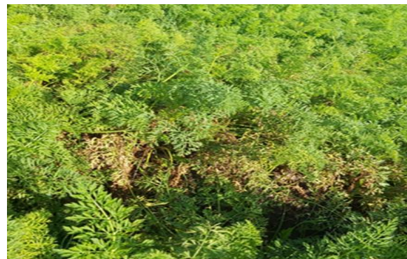
Fig. (1): Symptoms of Alternaria leaf blight on carrot plants under open field conditions on carrot cultivars in Qalubiya governorate, Egypt during November 2019.

Plant Pathology Research Institute, Agricultural Research Center, 12619, Giza, Egypt.